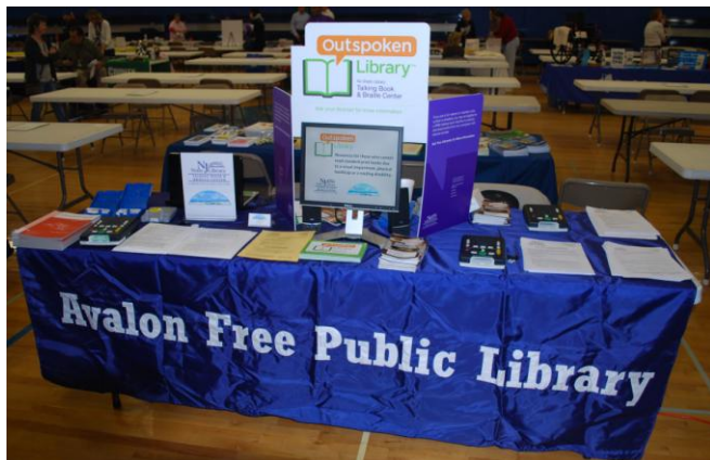
AFPL at the 2011 Cape May County Community Disabilities Awareness Day

library since the beginning of the year which was a 1% decrease from the same period last year (85,595).