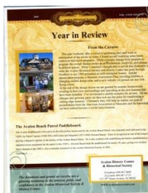
Year in Review cover 2009