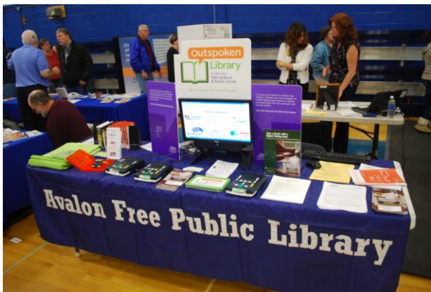
AFPL at the 2012 Cape May County Community Disabilities Awareness Day on Saturday, November 10.

Library Closes for Nor'easter – The library closed at 1pm on November 7 as a result of a nor'easter storm. The library was open for normal hours on November 8.